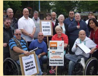
Comrades from Bolton and Wigan. Bolton day of Action 19 th August