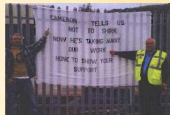
Honk your horn to show your support Porth Weekend of Protest 5 th August 2011