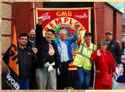
Remploy workers from Porth and Swansea show defiance in front of our National Banner 1911 Llanelli Railway strike Commemoration March and Rally 20 th August

We Fight Together We Win Together Onward to Victory for Remploy Workers