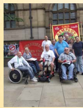
Day of Action Sheffield 30 th July Comrades from Sheffield Wigan and Bolton