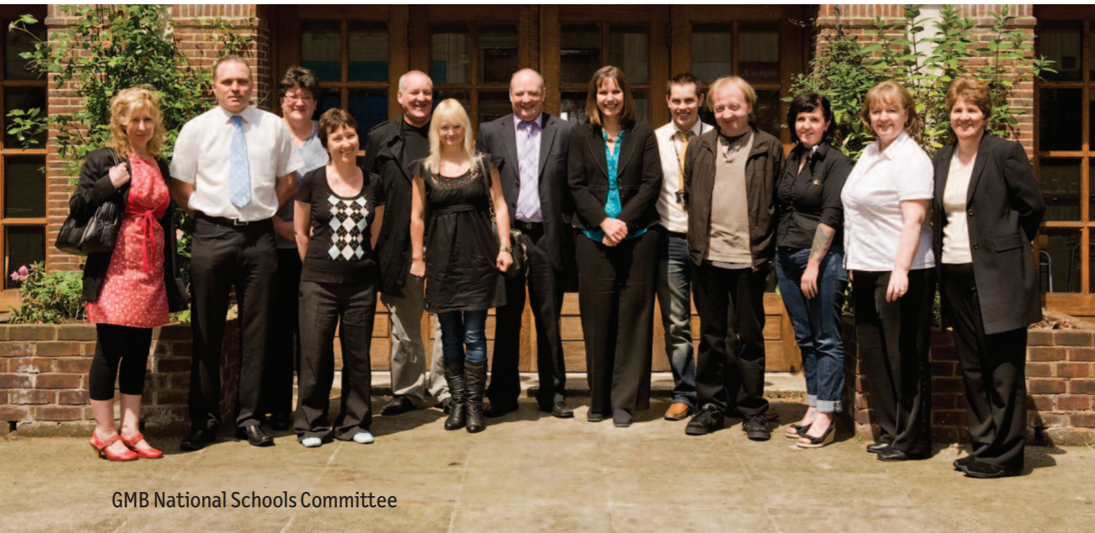
GMB National Schools Committee

School administrative staff often do not figure in education policy debates, yet without their dedication and goodwill, schools would simply not be able to function. GMB is pushing for urgent action on pay, on working time, and on sustainable staffing structures. We are determined to ensure that school administrative staff get their due recognition and reward.